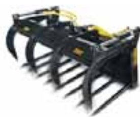
FORK & GRAPPLE