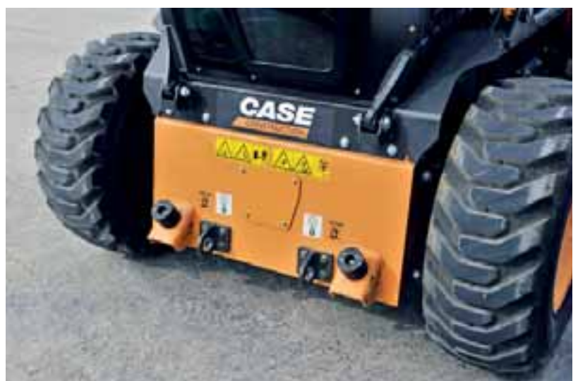
Chassis supports pushing power!

With these features, Case skid steer loaders deliver best-in-class bucket and lift breakout forces.