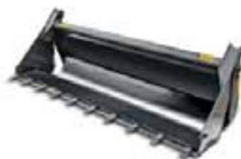
4X1 MULTIPURPOSE BUCKET