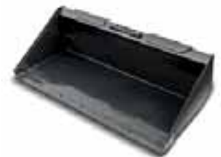
WIDE RANGE OF BUCKETS