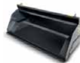
HIGH TIP BUCKET