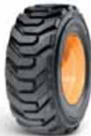
PREMIUM & PREMIUM W/LINER